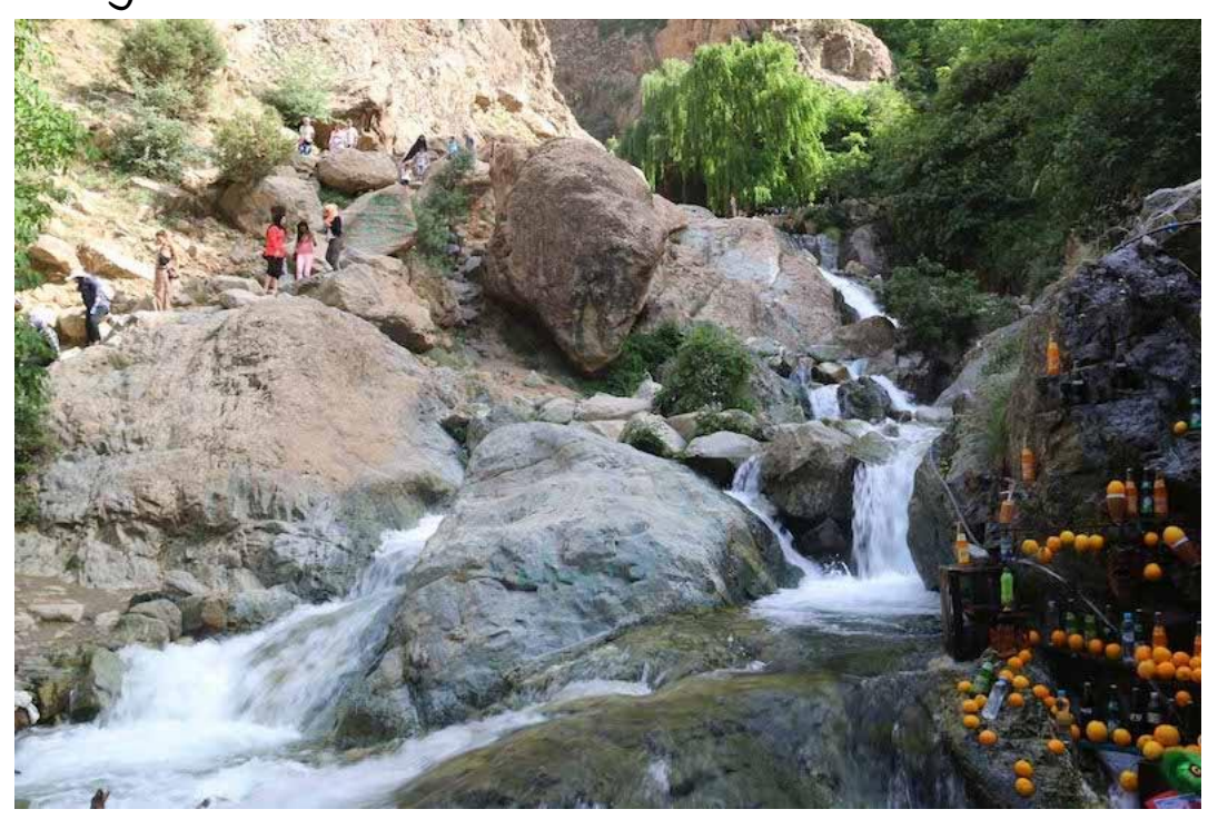
- **Experience:** Enjoy the natural beauty of the seven waterfalls and the surrounding landscapes. It's a great spot for photos and to enjoy a moment of tranquility.

moderately challenging, so wear comfortable shoes and bring water.